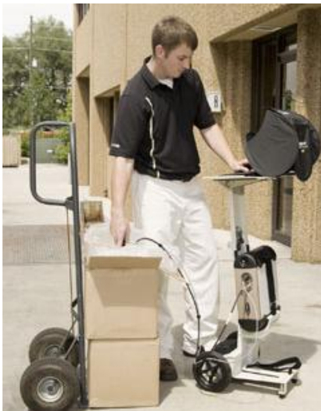
Fig. 1 – ASD LabSpec ®

With a wide spectral range (350-2500nm), true portability and unique post-dispersive optical system in LabSpec ® instrumentation, 100% inspection of raw materials and finished products becomes a convenient reality. Seamless user-friendly interfaces for the available data processing software packages enable rapid testing, typically just one second per sample. This can take place in Goods Inwards areas, on the manufacturing floor, or wherever it is needed, positioning you to meet GMP and FDA requirements - quickly and conveniently. In many cases this is easily possible by measuring with a High Intensity Contact Probe through the packaging. Why take samples when you can measure directly, in-situ exactly when and where you need an answer?!